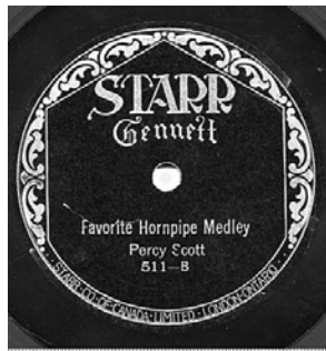
Starr Co. of Canada label

ing Guide , has written a label dating guide with matrix numbers and a general company history of both U.S. Gennetts and Starr/Compo in Canada (pp. 48, 161). He describes how "Starr" grew to be the favorite printed name on the Canadian label. (Also see The Virtual Gramophone at http://www.collectionscanada.com .)